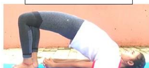
Setu Bandha Sarvangasana